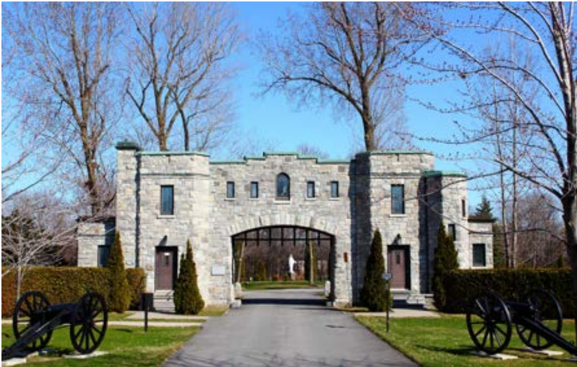
Gate of Remembrance at the National Field of Honour, Pointe-Claire, Quebec.