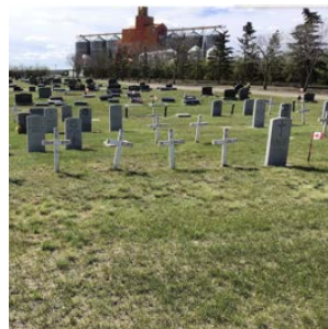
Unmarked Grave Program