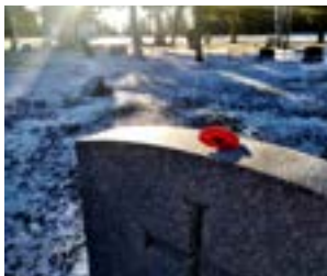
Funeral & Burial Program