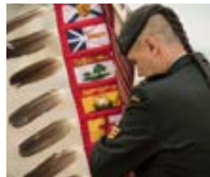
Indigenous Veterans Initiative