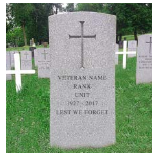
Lost Veterans Initiative