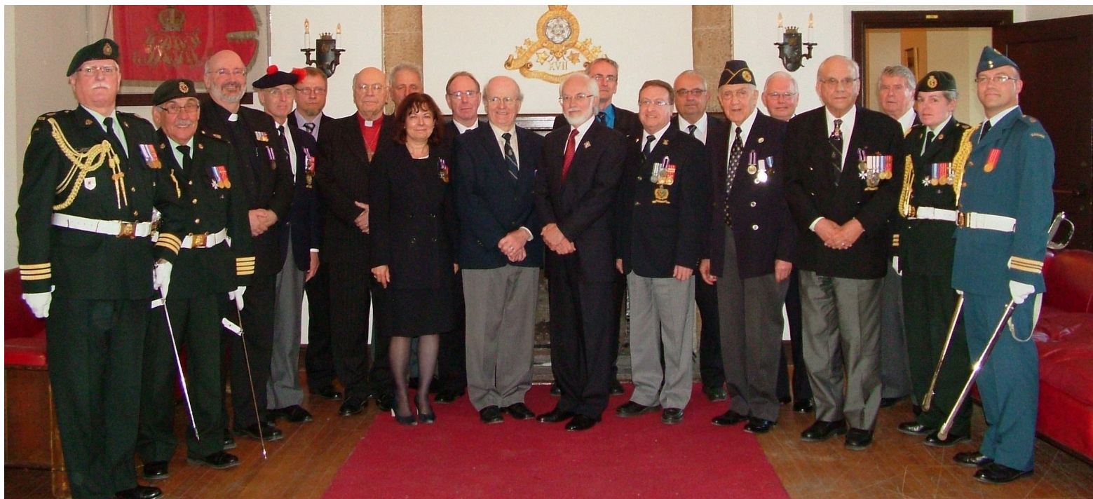
On May 20, the Honourable Pierre Duchesne, Québec's 28th Lieutenant Governor and the Honorary Patron of the Last Post Fund (LPF) Québec Region, was invited to deliver the LPF Long Service Medal to employees and volunteer members of the LPF Québec Region.